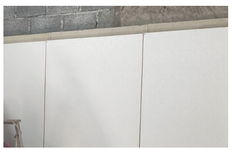
Glasbord® with Surfaseal® Sandwich Panels (Hygispan®)