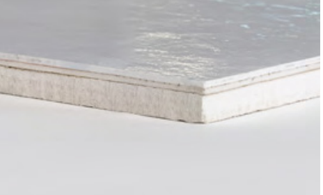
Glasbord® with Surfaseal® laminated on Rigid Board (Hygimat)