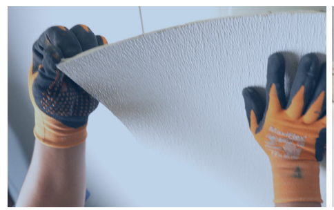
Glasbord® with Surfaseal® Self Adhesive peel and stick panels (Hygibreak®)